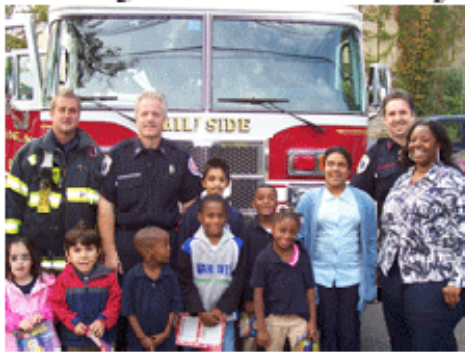
Firefighters at the Library