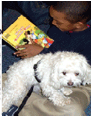
Adopt a Grandfriend